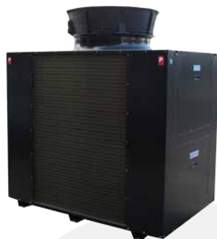
Axitop is optional

Experience the best in water chiller technology